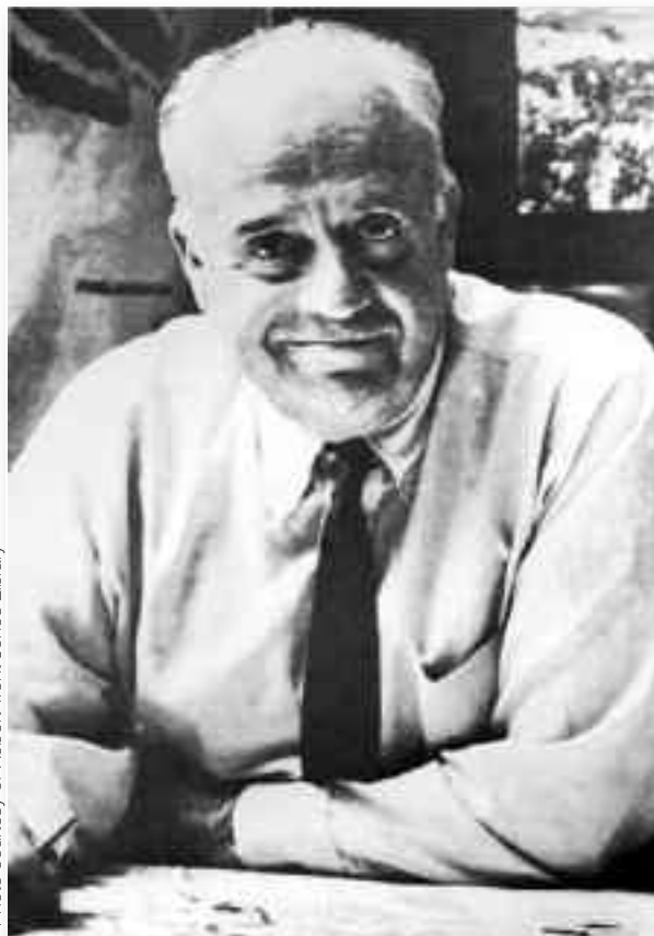
Robert Trent Jones