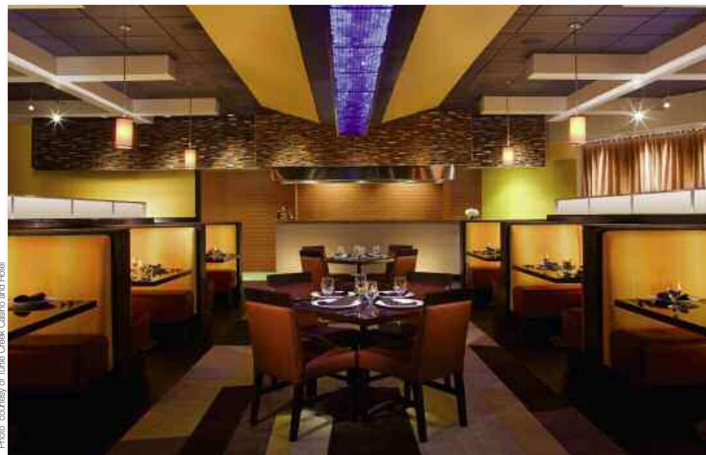
The new Turtle Creek Casino and Hotel features the Bourbons 72 Dining Room.

Timberstone Golf Course has partnered up with Marquette's Greywalls and Harris's Sweetgrass to form a powerful trioka of courses. While many golfers from lower Michigan thought long and hard about driving to Iron Mountain to try TimberStone, they now might now make the trip to golf these terrific courses..