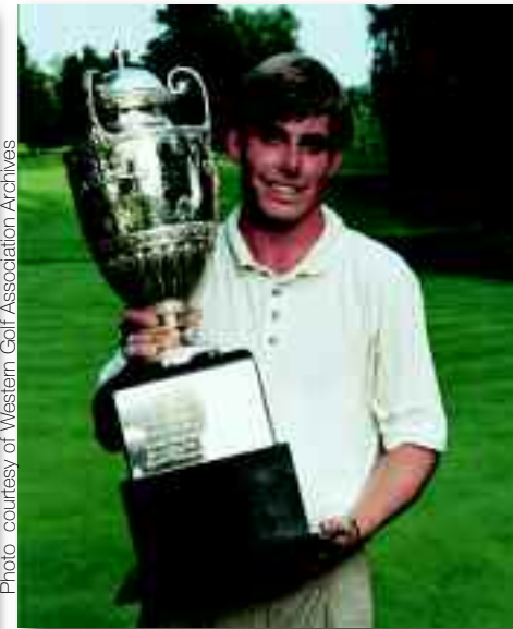
Justin Leonard, Western Amateur Champion, 1992 & 1993 and Runner-up 1991