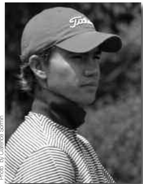
Camillo Villegas, Western Amateur Co-Medalist with Kevin Stadler, 2002