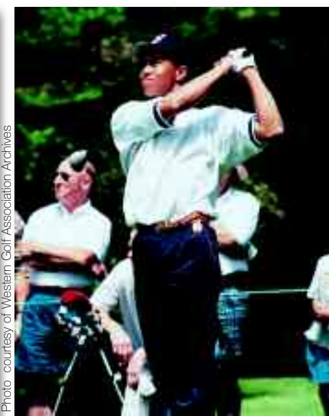
Tiger Woods, Western Amateur Champion, 1994