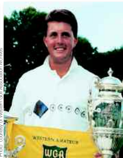
Phil Mickelson, Western Amateur Champion, 1991