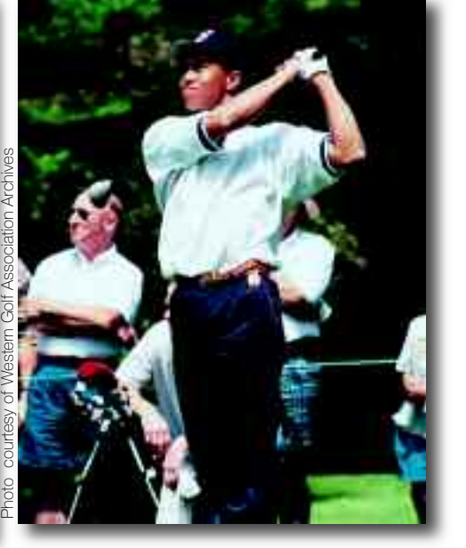
Tiger Woods, Western Amateur Champion, 1994