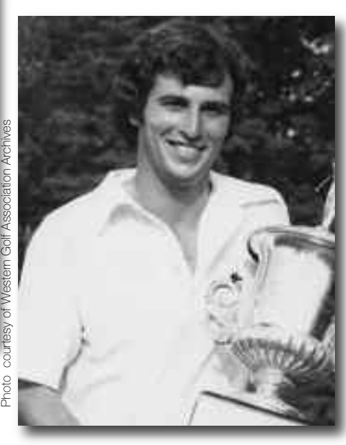
Curtis Strange, Western Amateur Champion, 1974

And all of them won at Point O' Woods Golf and Country Club in