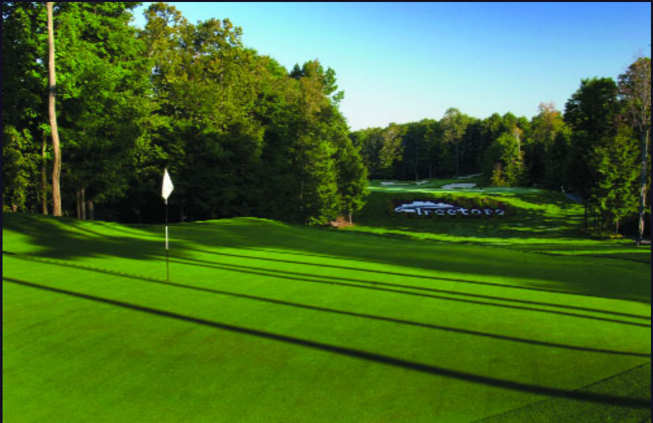
Rick Smith's Threetops, Treetops, Hole Number 1