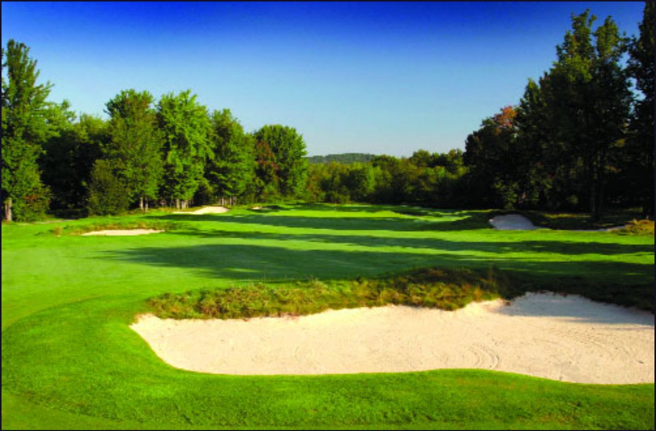
Rick Smith's Signature, Treetops, Hole Number 3