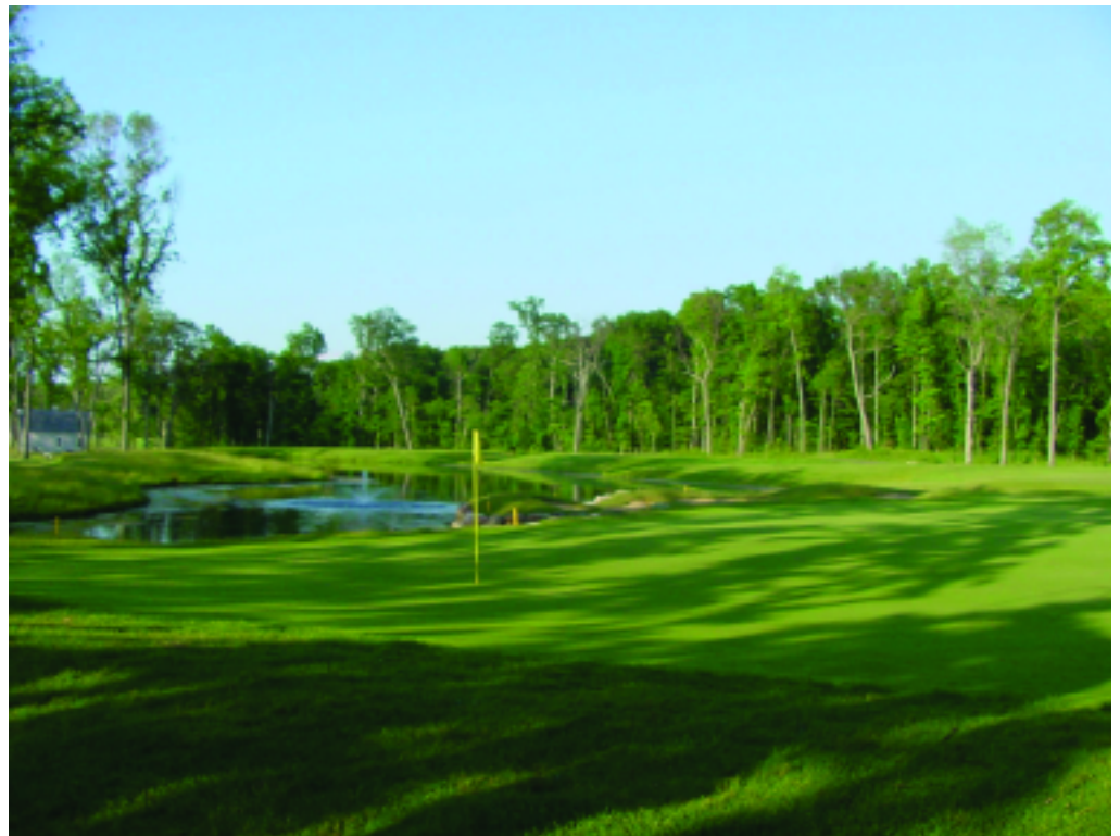
The Preserve, Hole No. 17.