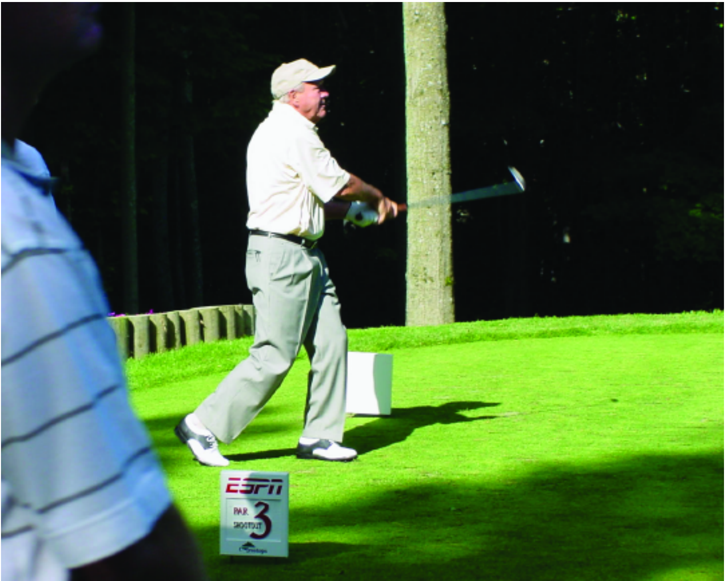
Arnold Palmer tees it up at Threetops Par-3 Shootout.

foray in Michigan golf architecture— was his work on The Legend at Shanty Creek Resort.