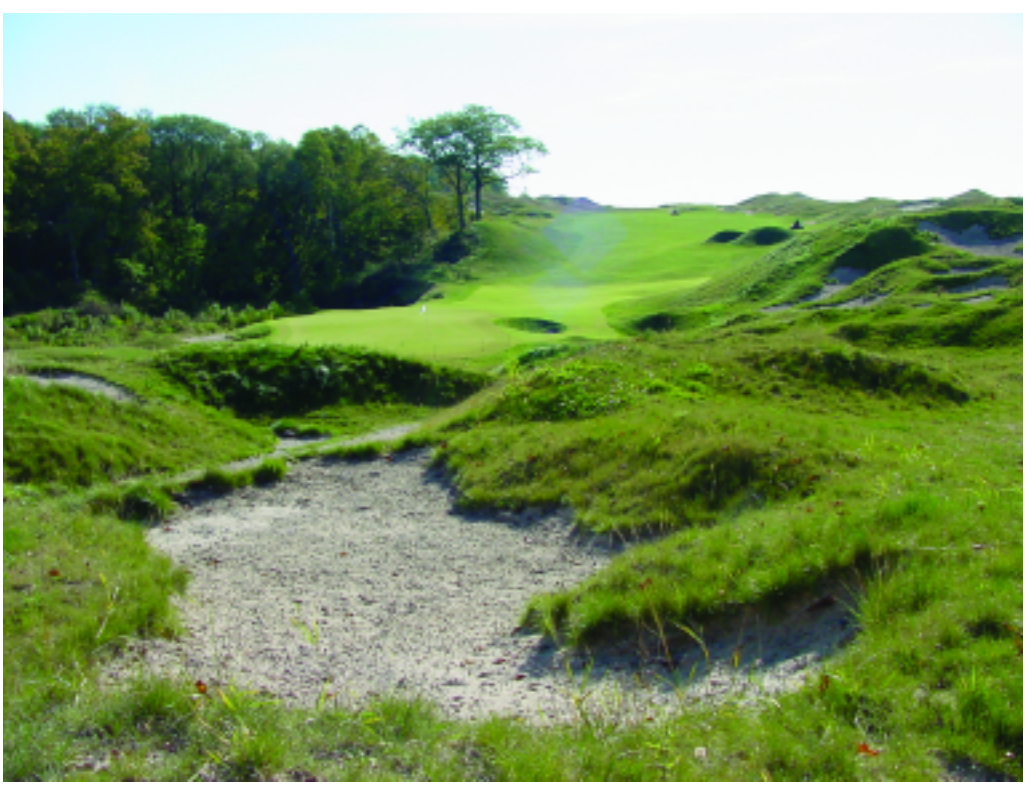
Hole No. 18 at Whistling Straits.