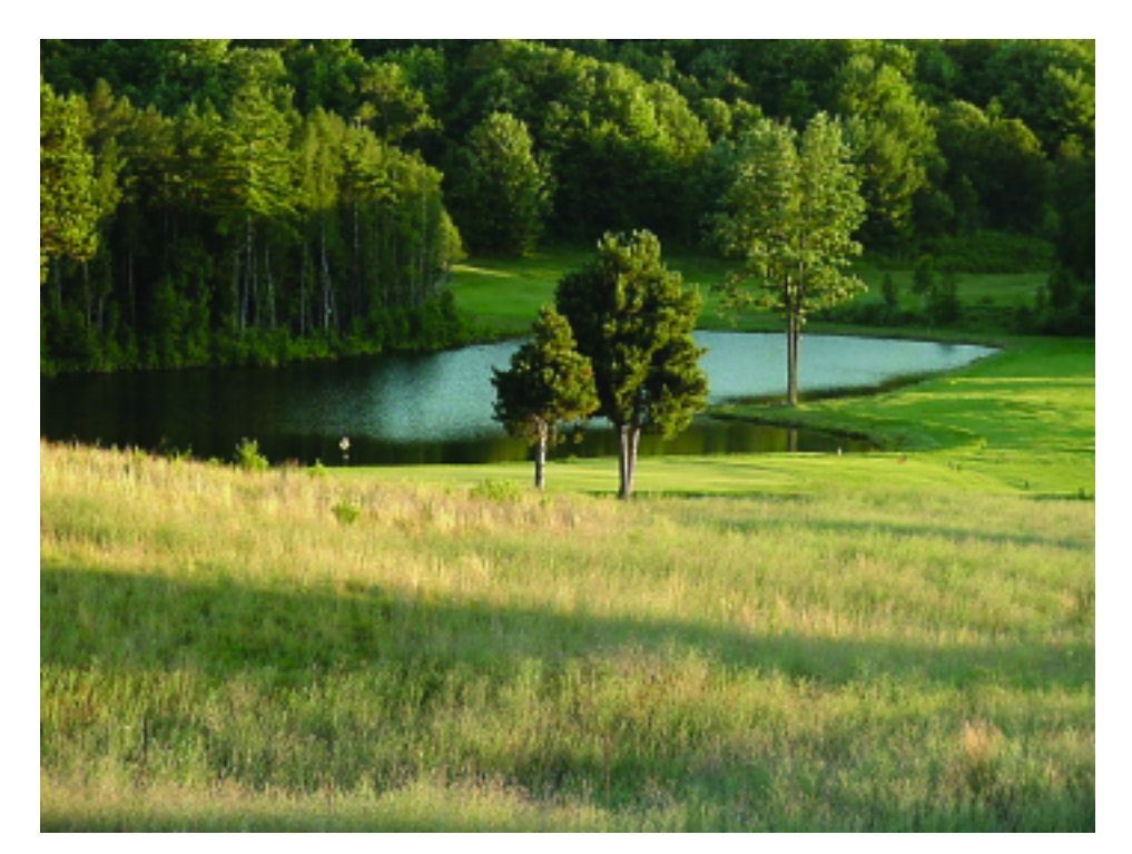
Hole No. 18 at High Pointe.