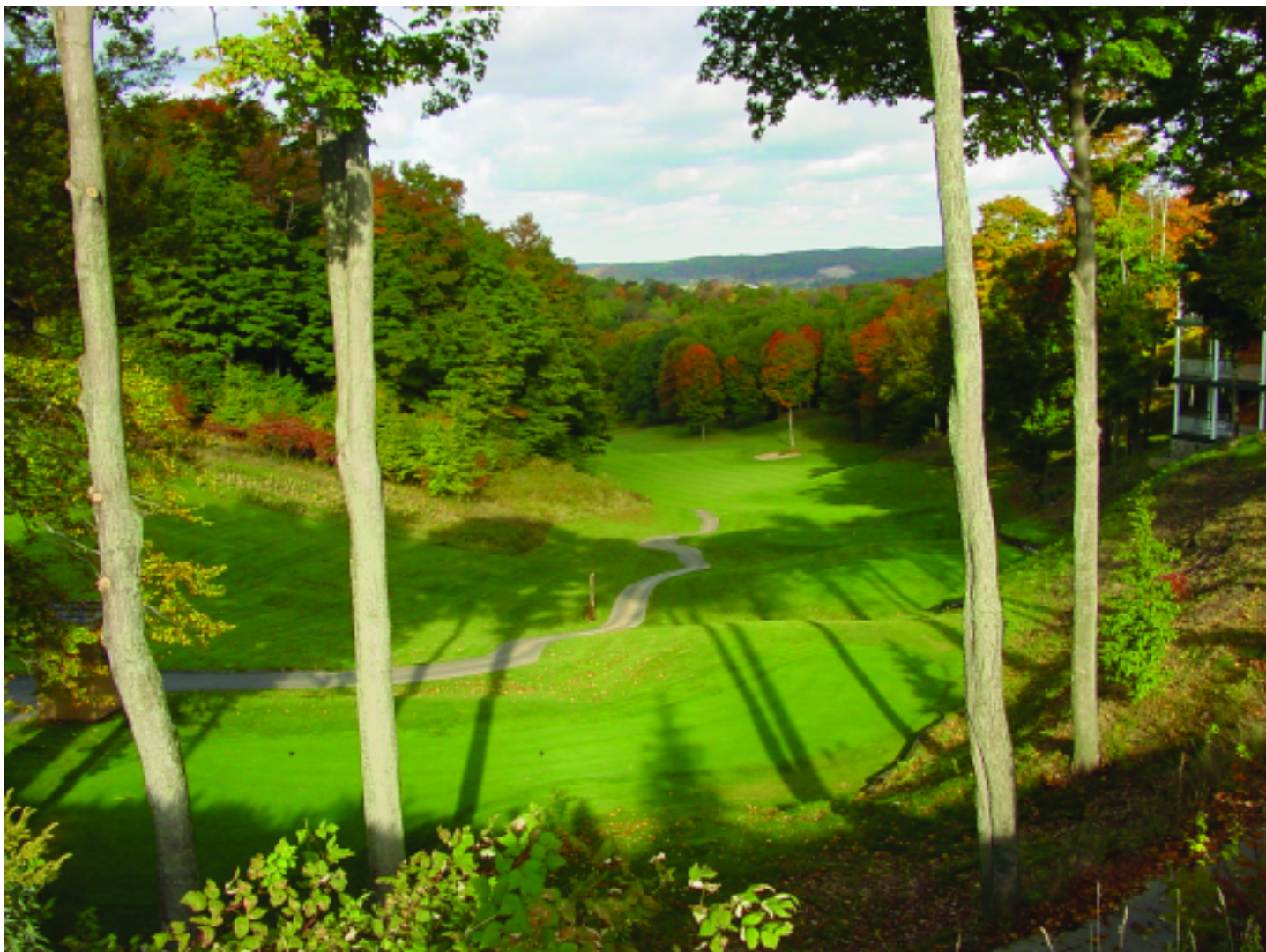
The Legend, Shanty Creek